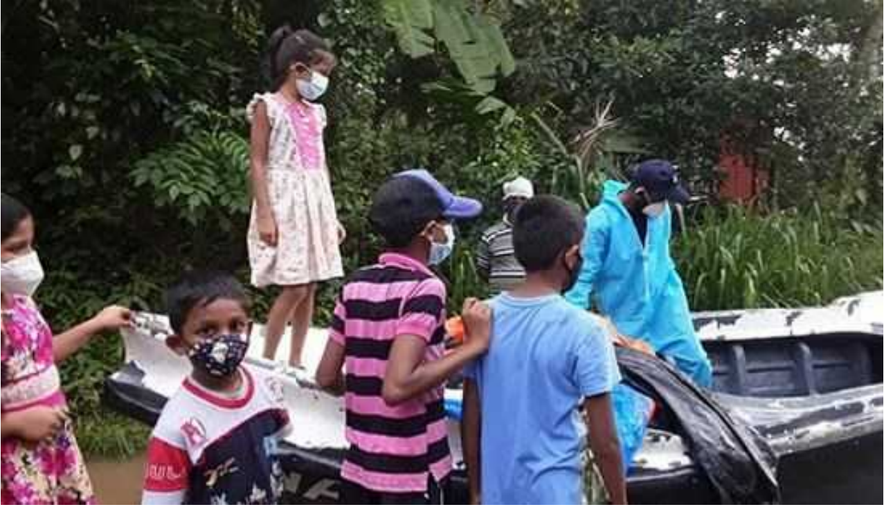
FIGURE 5: Affected families rescued by Navy teams in Biyagama

This report was produced with the technical support of World Food Programme (WFP)