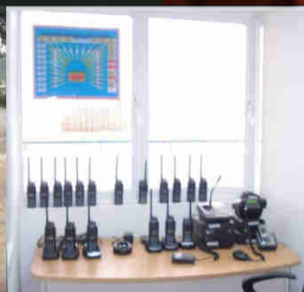
HF and VHF equipment in use