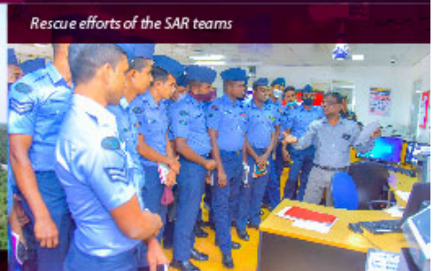
Rescue efforts of the SAR teams