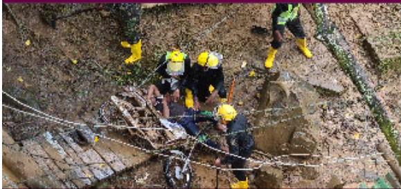
Rescue operation exercise