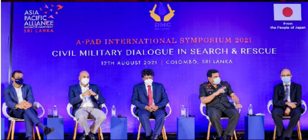
APAD international symposium - Civil Military dialogue in search and rescue