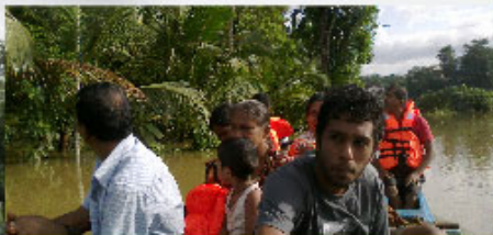
Rescued people en-route to camps