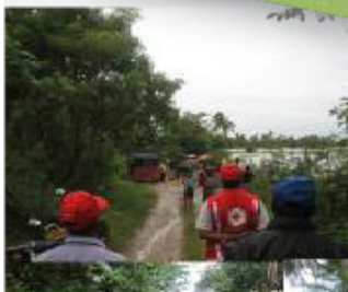
Response by volunteers (SLRCS)