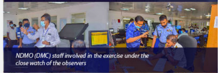
NDMO (DMC) staff involved in the exercise under the close watch of the observers