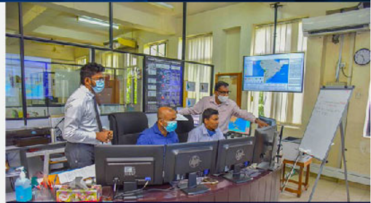
NTWC (Department of Meteorology) in action

IOWAVE20 in Sri Lanka was conducted in collaboration with ICG/UNESCO IOTWMS and University of Huddersfield as international partners, and was led by the DMC, Sri Lanka, also with the input from a large number of local partners.